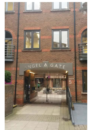
Exterior of gate 5